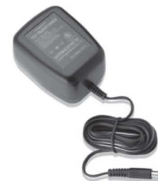
LEAPSTER AC Adapter