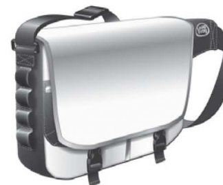
LEAPSTER Messenger Bag