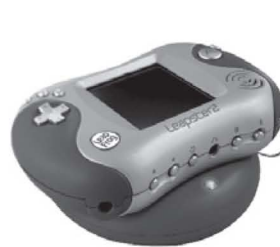
LEAPSTER2 Recharging System