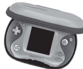
LEAPSTER Carrying Case