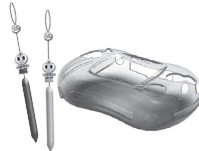
LEAPSTER2 Style Set - Jelly and Stylus Charm