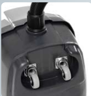
The vacuum cleaner has 2 castors in the front for easy manoeuvring