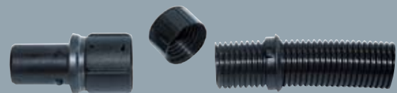
Hose damage can easily be repaired thanks to the cut-and-fix system.