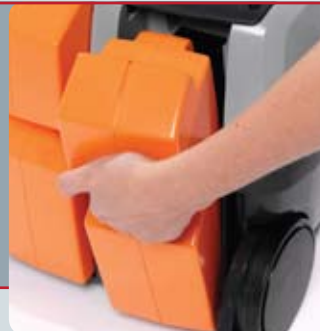
Batteries are easily accessed for charging and replacement. Orange batteries for warning/safety.