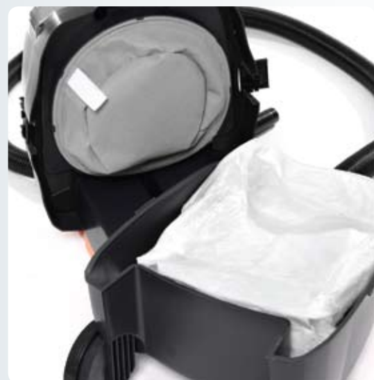
Large dust bag is designed for maximum filling