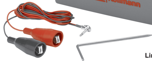
KD-4000 Line Transmitter