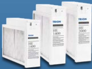
Electronic Air Cleaners

Trion® Media Air Cleaners come with a ten-year limited warranty.