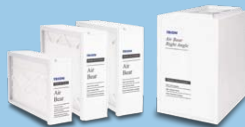
Air Bear® Supreme

Trion® air cleaners feature charged-media filters that effectively capture large and small airborne pollutants to MERV 8 or MERV 11 filtration standards. High-efficiency media air cleaners can clean large amounts of air while offering whisper-quiet operation. The Trion® Air Bear® line of ducted media air cleaners easily attach to your home's heating and cooling unit.