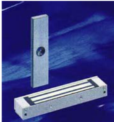
300S E. M. Lock