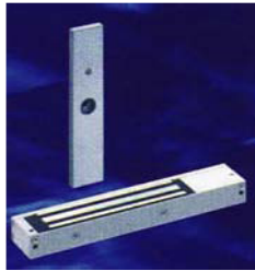
600S E. M. Lock