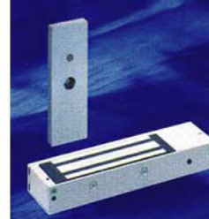
12000S E.M. Lock