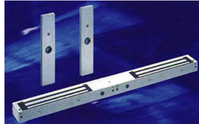
600D LED E. M. Lock