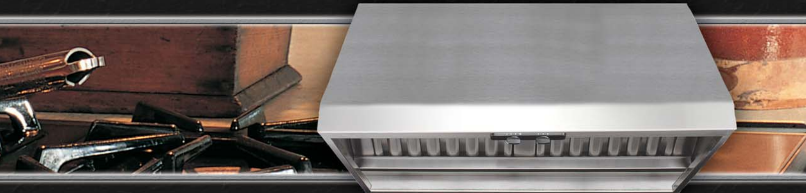
18" Height Series

Create the kitchen an Executive Chef would be envious of with the Professional Range Hood Series.