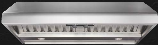
10" Height Series

Create the kitchen an Executive Chef would be envious of with the Professional Range Hood Series.