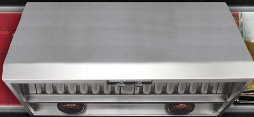
18" Height Series