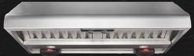
10" Height Series

Create the kitchen Chefs dream of using the Professional Range Hood with Heat Lamp Series.