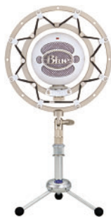
Snowball mounted on The Ringer

The Snowball features a unique swivel mount located on the bottom center of the mic body. Be sure to mount the Snowball on the Blue Snowball desktop tripod or on a standard-thread counter-weighted tripod mic stand. And for reduction of low-frequency rumble and additional positioning options, mount the Snowball in the Blue Ringer, available from your authorized Blue dealer. Though the Snowball is extremely durable, we would hate to see it fall due to an inadequate stand. Also, be sure to position the Snowball over the center leg of the tripod to further prevent tipping. Once mounted, you can gently pivot the Snowball back and forth for optimum positioning in front of the sound source.