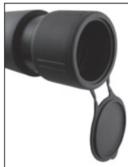
Sun Shade Extended