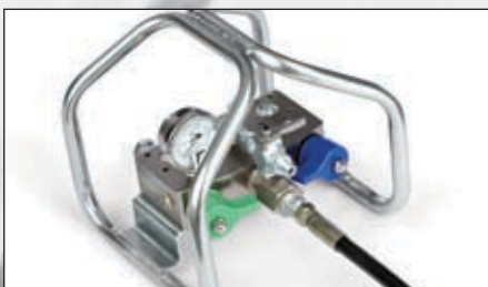
Remote Mix Manifold

Material mixing reaches a new level of precision due to new dosing technology. With the Graco XM, the minor component (or side B material) is injected at high pressure into the major material (side A). Advanced sensors allow pumps to compensate for pressure fluctuations, resulting in accurate, on-ratio mixing for better yield and less waste.