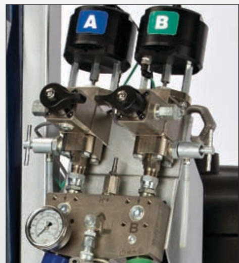
Standard Mix Manifold

Choose standard, frame-mounted mix manifold or remote mix manifold; both include a pressure gauge that displays fluid output pressure.