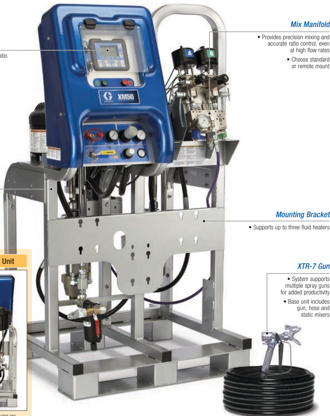
Graco XM Plural-Component Sprayer (base model)*

Xtreme pumps and Merkur™ flush pump are standard on the base unit. Easy crane transport using eye hooks on air motors.